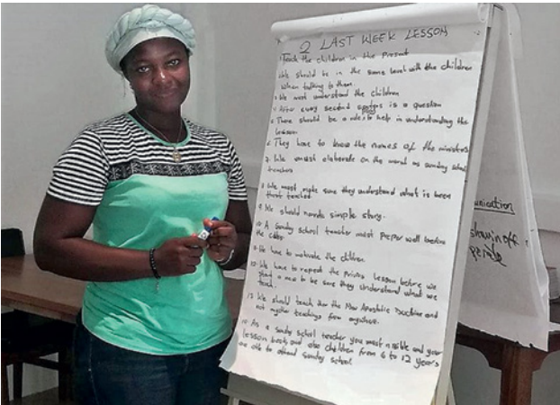
Teachers have to learn too. Sisters and brothers who teach in a Church context in Ghana come together for regular training

me, but not all things are helpful; all things are lawful for me, but not all things edify.”