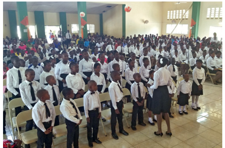
During his three-day stay on the island of Hispaniola, the Chief Apostle met with the Apostles and Bishops and conducted services in Santo Domingo and Léogâne

“Don’t become weary of doing good,” the Chief Apostle appealed in conclusion. “Because it is God Himself who promises you: ‘You will never regret it.’”