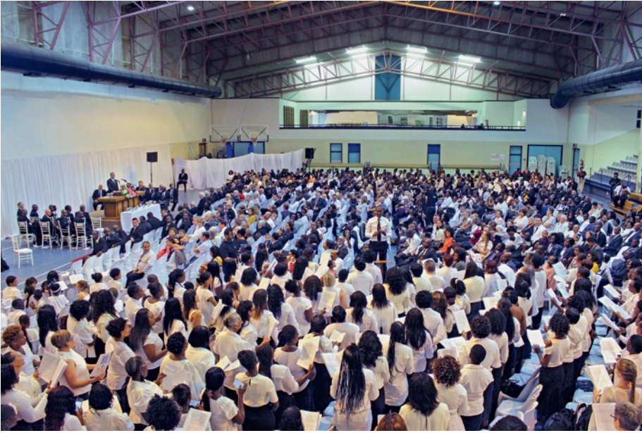
The service in Walvis Bay took place at the Indoor Sports Complex and was attended by about 1,700 brothers and sisters

of Jesus Himself. He made this very clear.” But even if God expects more, “Don’t forget, whatever happens in your life, God is fair. He will provide you with everything you need to fulfil His will and to answer His call.”