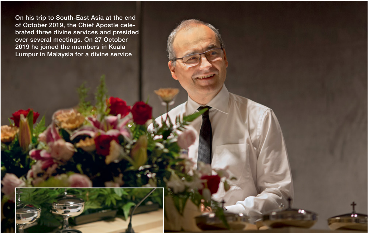
NAC South-East Asia

On his trip to South-East Asia at the end of October 2019, the Chief Apostle celebrated three divine services and presided over several meetings. On 27 October 2019 he joined the members in Kuala Lumpur in Malaysia for a divine service