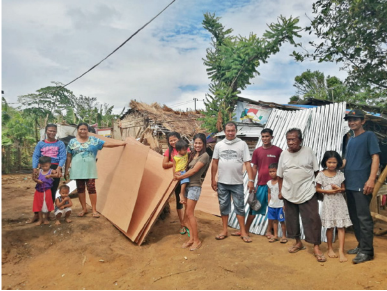
Thousands of people lost their homes when a typhoon made landfall in the Philippines in December 2019. Corrugated iron sheets, lumber, and nails were supplied in particularly hard hit areas