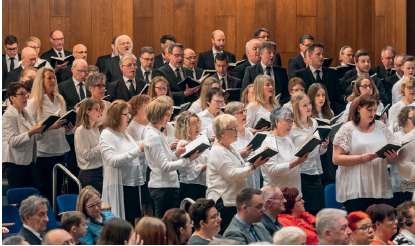
The choir from the district of Hagen saw to the music in the service in the Meinzerhagen City Hall. Thousands of New Apostolic Christians participated in the divine service live by satellite, over the Internet or telephone