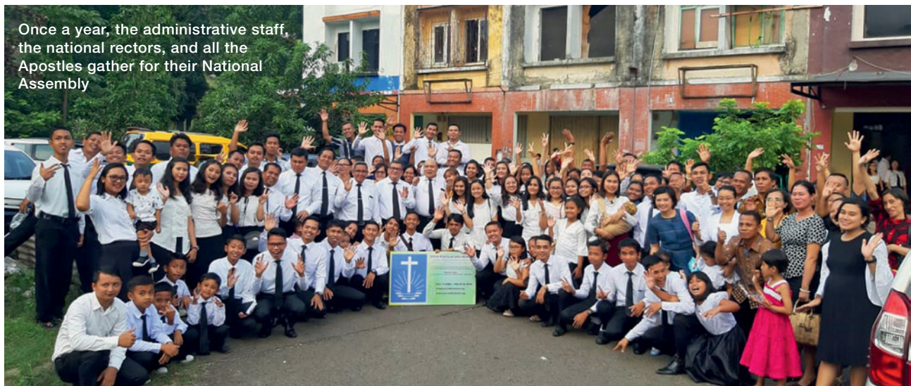
Once a year, the administrative staff, the national rectors, and all the Apostles gather for their National Assembly

By their very self-definition, Christians are not lone warriors. And this is also shown again and again in the course of every subsequent week on all continents and in many thousands of congregations.