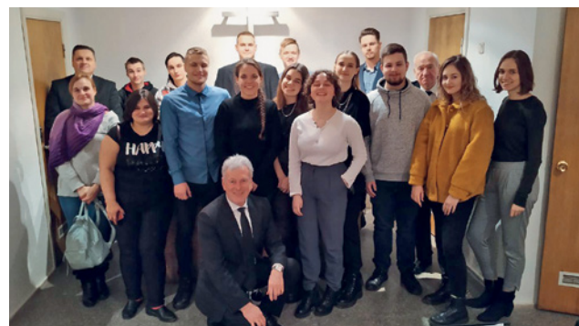
Young people from various congregations in Lithuania at a regional youth service in our church in Vilnius