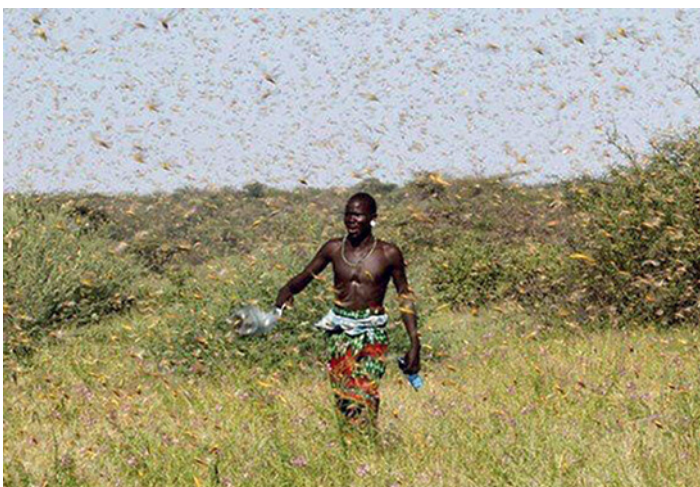
Huge swarms of locusts devour and destroy crops within minutes

The charity went on to report that employees had been preparing for aid measures in the heavily affected areas in the north of Kenya, in cooperation with other aid organisations in East Africa. Foodstuffs and seeds were to be distributed in this region before reforestation efforts got underway. Training measures for farmers were also being considered so that these extensive relief projects could be better coordinated.