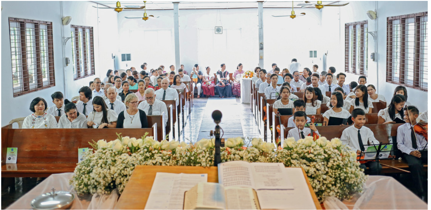
NAC South-East Asia

Nearly 300 participated in the divine service in the congregation of Laying Suh in Kalaymyo