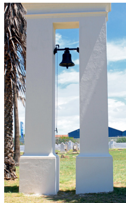
The church building was dedicated in 1820 by the Dutch Reformed Church, was declared as a provincial cultural heritage site in 2000, and has been used by the New Apostolic Church since 2014

In 1817 some farmers asked their governor, Lord Charles Somerset, for permission to construct a church in the area of the mountain region of Helderberg and establish a village there. Their application was granted, and construction began in 1819. On 13 February 1820 the church building was officially dedicated.