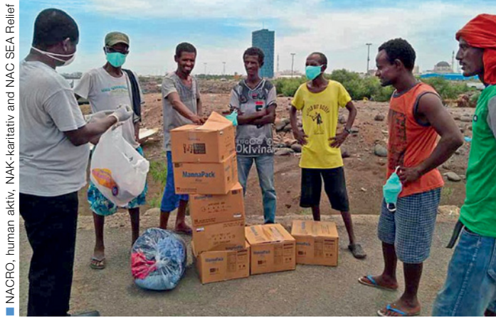
A food aid project run by NAK-karitativ (NAC Germany) is helping people to get by