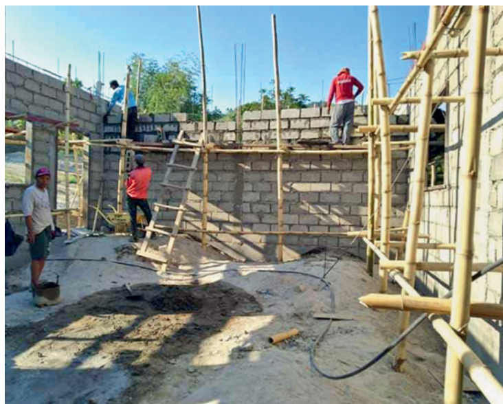
This building is going up with funds from NAC SEA Relief Fund (NAC South-East Asia)