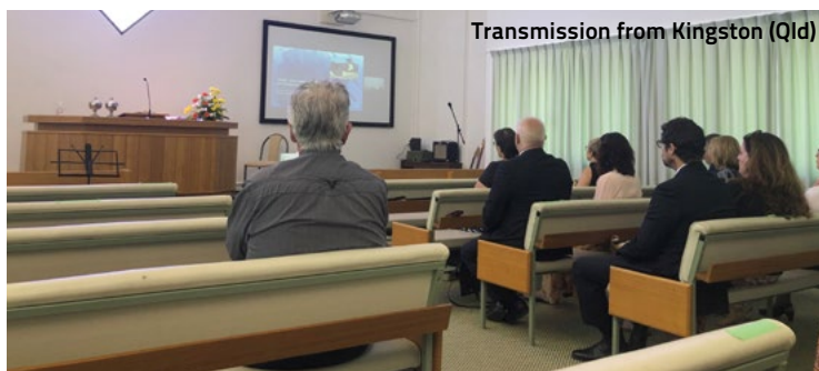
Transmission from Kingston (Qld)