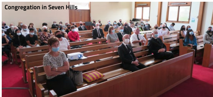
Congregation in Seven Hills