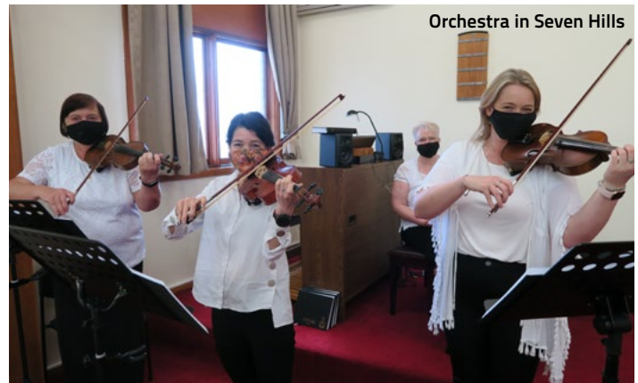
Orchestra in Seven Hills