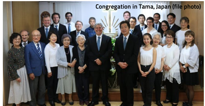
Congregation in Tama, Japan (file photo)

After the divine service, the congregation celebrated with fellowship and a slice of cake.