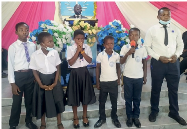
Top left and right: The confirmands from Vo (Togo) and the confirmands from Lelystad (Netherlands) Left: Some of the children recited Bible verses during the service in Tarkwa (Ghana)

New Apostolic church in San Isidro. NAC SEA Relief Fund, which had helped with relief efforts after the disaster, was also able to finance the rebuilding of the destroyed church.