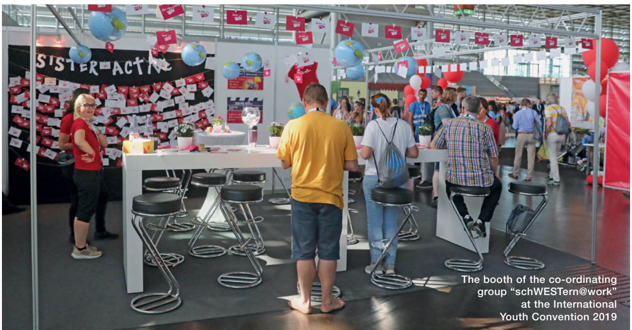
The booth of the co-ordinating group “schWESTern@work” at the International Youth Convention 2019

This coordinating group is not only the point of contact for all topics relating to women and girls. It also provides information on tasks and services that women perform in the New Apostolic Church. This includes, for example, an extensive survey that was conducted during the International Youth Convention 2019.