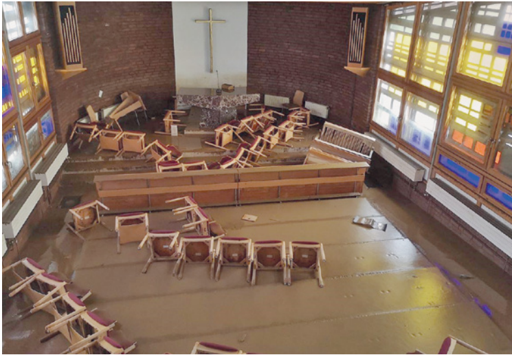
Left: The flooded church in Sinzig (Germany) Below: The rebuilt church in San Isidro (Philippines)