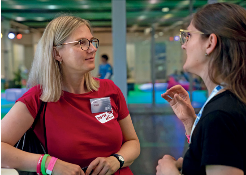
The sisters at the booth discovered that 93 per cent of the members would like sisters appointed to pastoral care in their congregation

This opinion poll was part of the concept behind a 900-square-metre exhibition and discussion area focused on the matter of pastoral care. The offer was organised by a project group comprised of New Apostolic women from all the Regional Churches of Germany, Switzerland, and France. The team members were appointed by their respective Apostles. The survey was intended to explore what pastoral care means to young people and which communication channels they would prefer for pastoral care discussions.