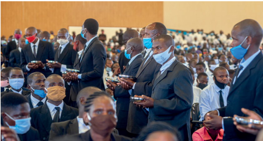
During the celebration of Holy Communion