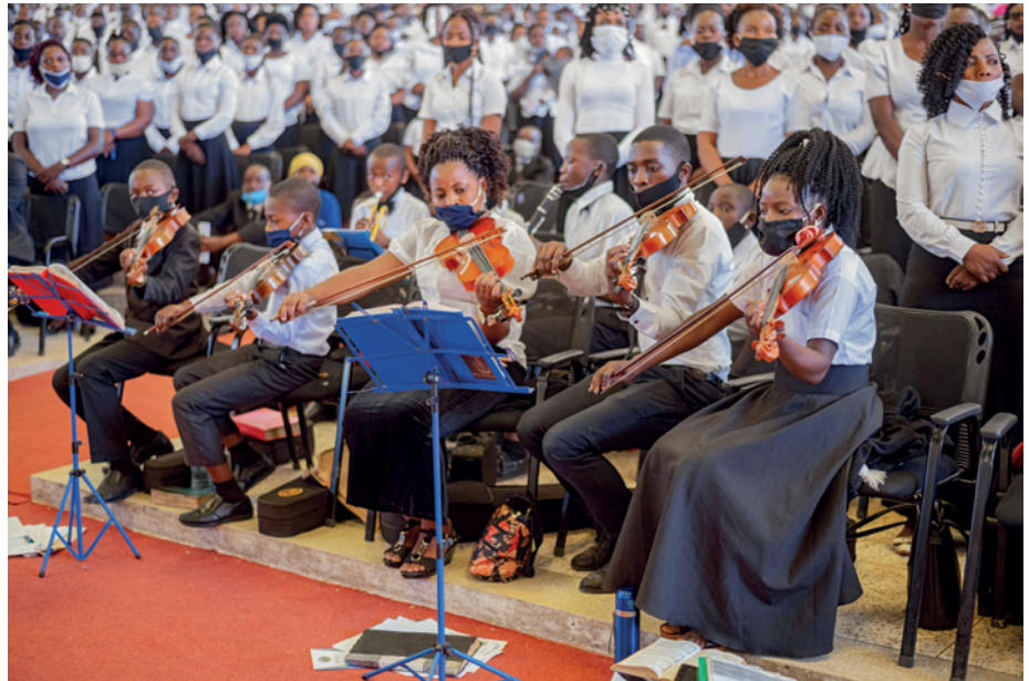
A choir and a string ensemble created a beautiful atmosphere