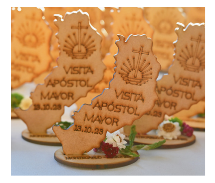
A lot of love and preparation had gone into the visit of the Chief Apostle. There was even a miniature version of the province of Misiones as a souvenir

Christ did not live up to their idea of the promised deliverer: "He Himself was a mustard tree, not a great, majestic cedar tree, because even at the end of His journey He was still a humble man. They hung Him on a cross and He was weak. He was alone, abandoned. This was far removed from a majestic tree."