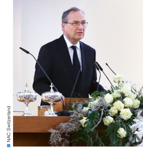
1 Thessalonians 5: 17