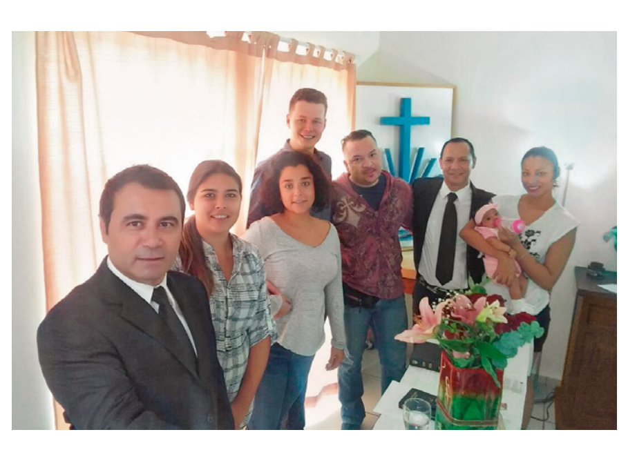
The house congregation in Querétaro

But is it really that easy when you are alone, with no one else around? "Well, this requires that I become active," he says. "I can't just say, well, God, there is no church here. So what can I do?" He himself made the experience that when God sees