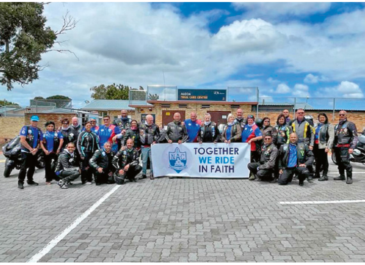
The Annual Toy Run is a tradition in South Africa, and it is all for charity. Bikers rally together to help needy children