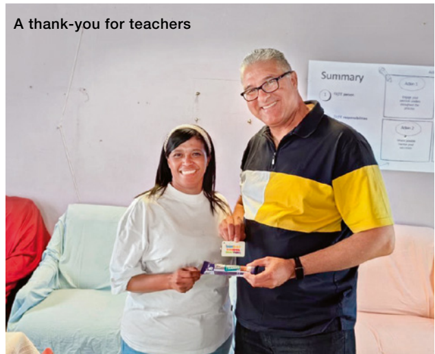
A thank-you for teachers