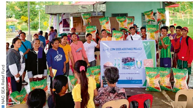
Seeds for remote villages

Good news from all over. A group of young people in Europe planted trees, helpers in Asia distributed seeds in remote areas, and teachers in Africa went back to school. The stories are inspiring and encourage us to follow suit.