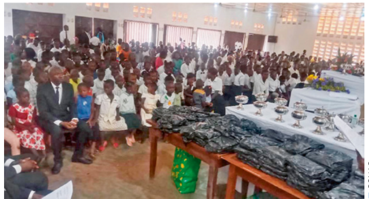
Many people in the Central African Republic live in extreme poverty. The aid organisation OSNAC is on the ground and doing its share to help where it can

quickly. On 12 January, the helpers distributed non-food items. The kits contained cooking utensils, hygiene products, and urgently needed medicine. On the ground, the helpers kept their eyes open to see if they could organise any further aid that was needed. In the worst affected areas, OSNAC was able to help two hundred flood victims with the kits and provide further assistance to another fifty people who had been impacted severely. This was all made possible by a donation from the New Apostolic Church of the Central African Republic.