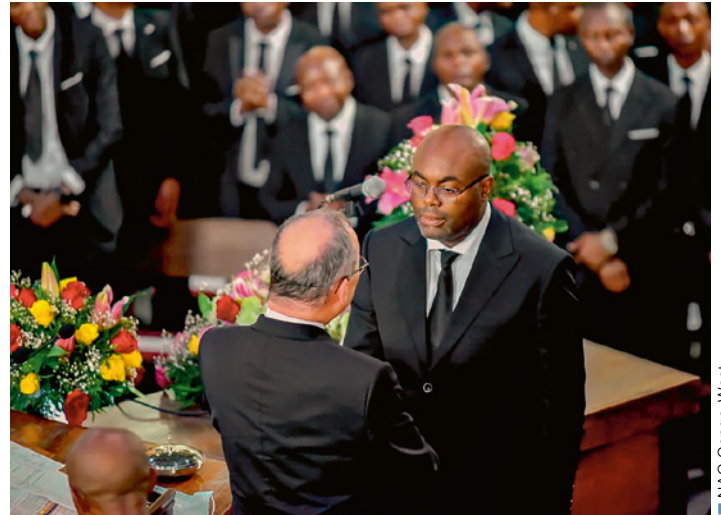
■ NAC Congo-West