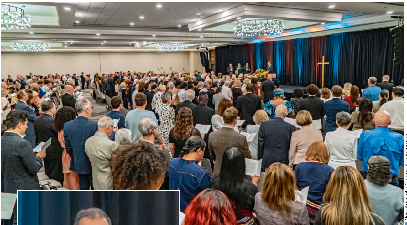
New Apostolic Church San Francisco