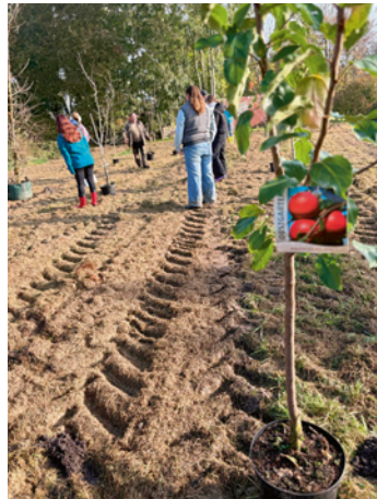
Young people engage in a tree planting project