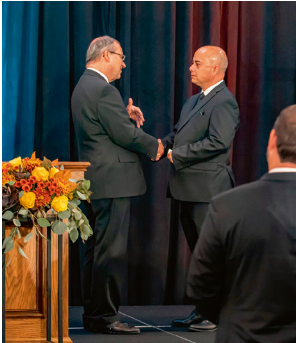
NAC San Francisco