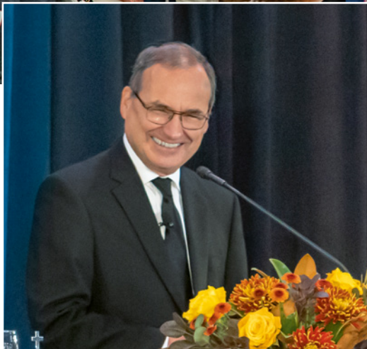
Chief Apostle Jean-Luc Schneider conducted a divine service in San Francisco, California (USA) on 13 October 2024