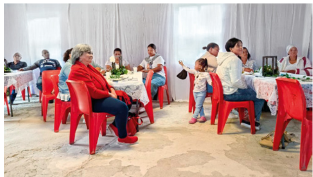
NAC Southern Africa