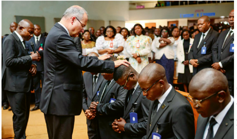
NAC Congo South-East