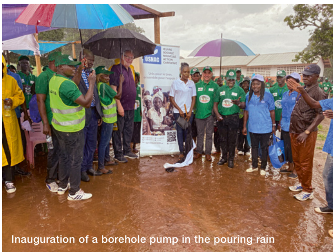
Inauguration of a borehole pump in the pouring rain

After the colonial era, the country was plunged into many crises and today rebels and militias fight each other. A path toward stabilisation is almost impossible: the losses and the