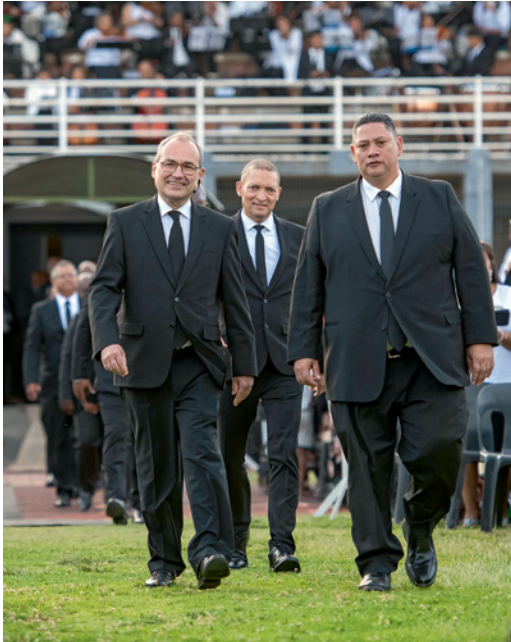
Chief Apostle Jean-Luc Schneider conducted a divine service in Worcester in South Africa on 5 December 2024