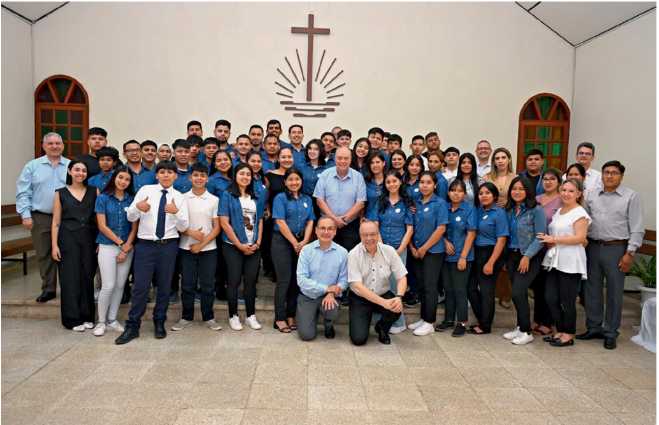
NAC South America