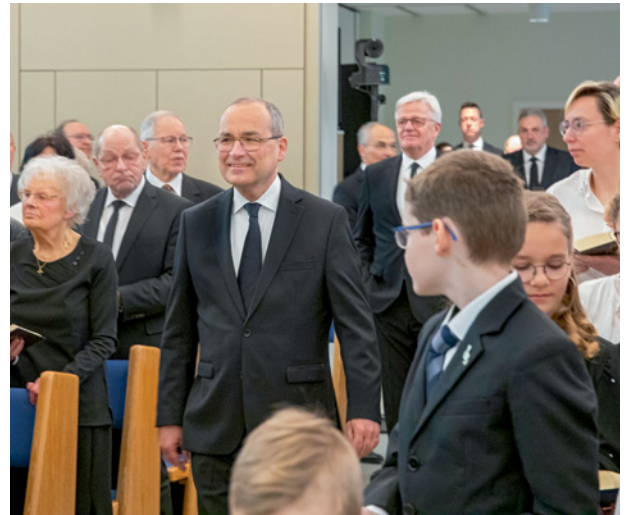
The Chief Apostle conducted a divine service in Spreewald in Germany on 12 January 2025

“He who observes the wind will not sow.” The Bible text refers to the image of a farmer who refrains from sowing in windy conditions so that the seed is not carried away. “Sowing in the Bible is often used as an image for our way of life,” the Chief Apostle said. “The wind is an image for all the things that make sowing difficult.”