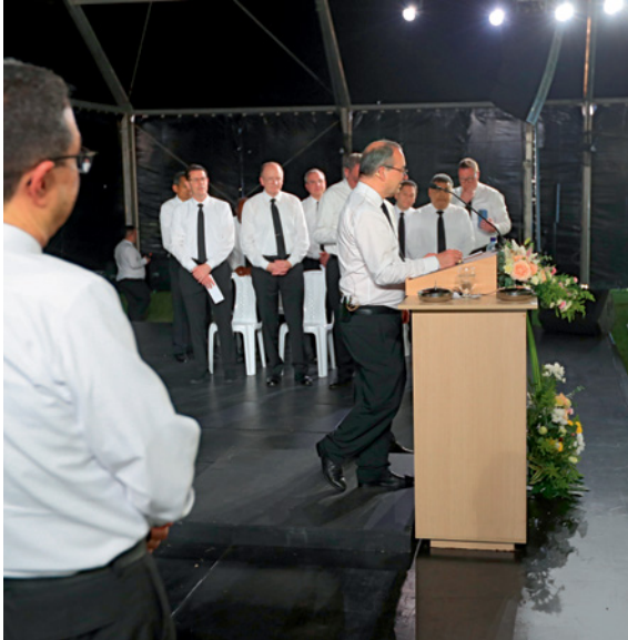
The Chief Apostle conducted a divine service in Cúcuta in Colombia on 15 February