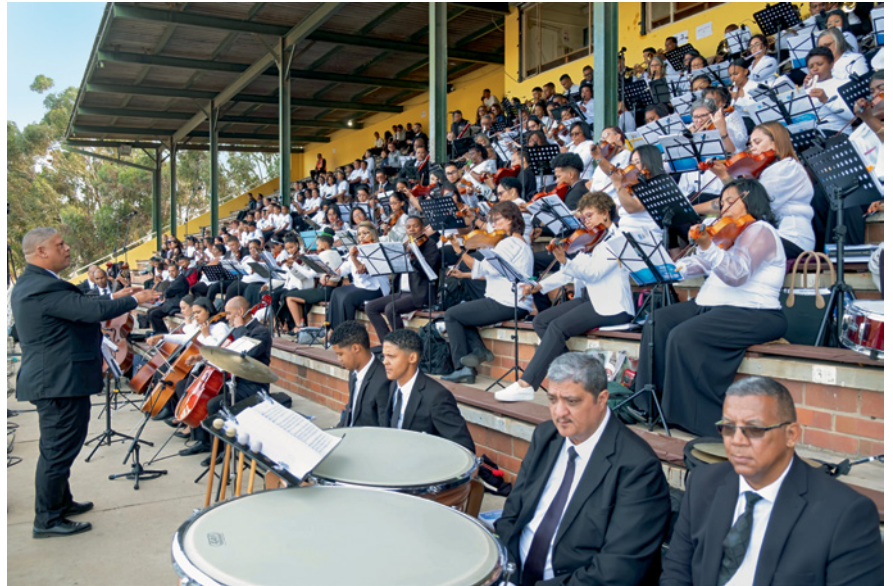
The service took place at the Boland Park Stadium

“What is important in order to remain faithful and loyal to Him?” the Chief Apostle asked and then went on to list the following points: