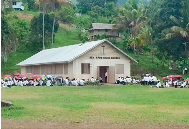
NAC Papua New Guinea

Relief supplies at last. It took a huge effort to bring the supplies into the mountain area