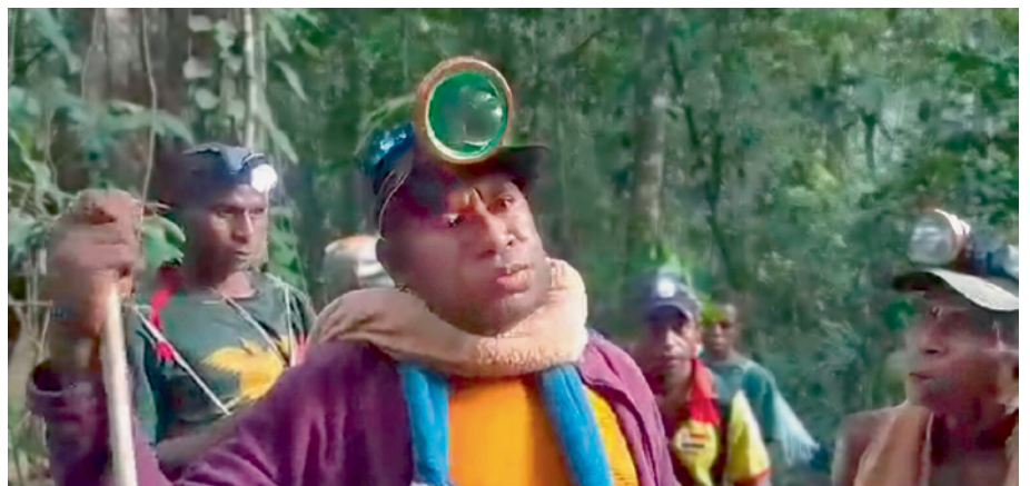
On a three-day trek through the jungle

In the wake of this disaster, funds were donated to provide much-needed aid to help the survivors: gardens and crops