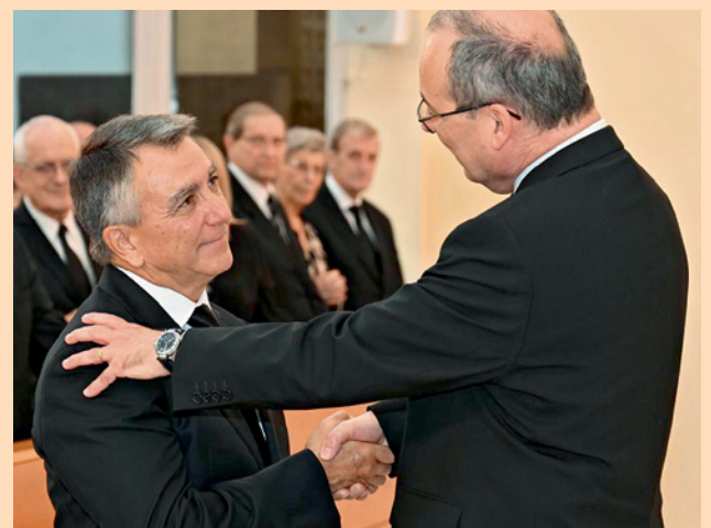
NAC South America

The new District Apostle Helper was born on 16 March 1966 in Colonia del Sacramento in Uruguay and grew up in a New Apostolic home. He was ordained as a Subdeacon in 1985, his first ministry. He was ordained an Apostle in 2011 and has been responsible for the New Apostolic Christians in Uruguay since then. He is married and has one daughter.