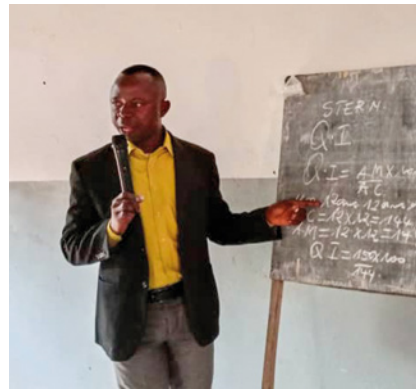
Sunday School teachers and one of the instructors during a lecture

phase is still to come, which will then effectively involve and cover all congregations in the south-eastern part of the DR Congo. This will be the final phase of the training programme. The long-term objective is clearly defined: to