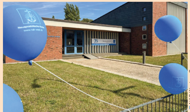
NAC Western Germany

The anniversary service commemorated this new beginning, the New Apostolic Church of Western Germany reports. A new Bible was placed on the altar: a gift from the district youth. The previous Bible had been destroyed in the flood.