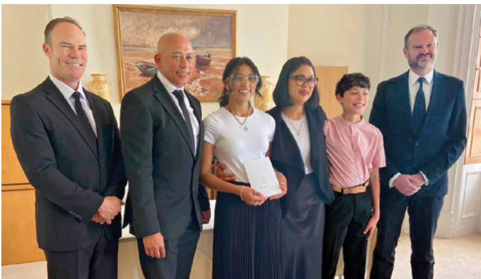
Confirmation in the congregation