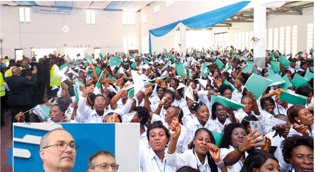
NAC DRC South-East