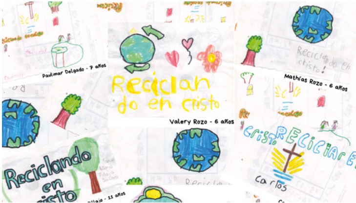
The Sunday School children designed logos for the recycling project