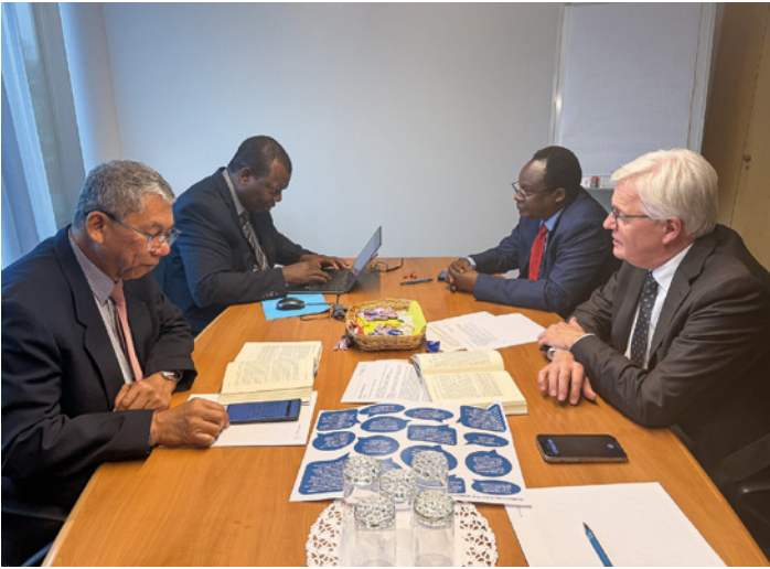
At the District Apostle Meeting held in November 2025, the District Apostles and their assistants engaged in small-group discussions on pastoral care

develop special pastoral care offers for members in special phases or circumstances of life,” the Guide for Ministers adds in chapter 7.10.