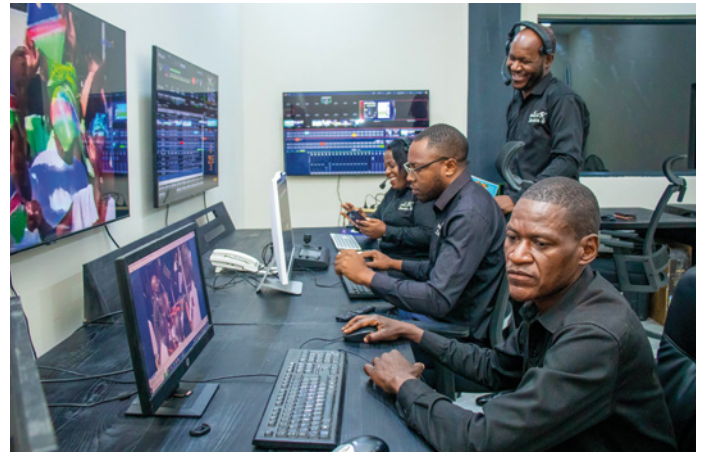
The media team of NAC28TV at work