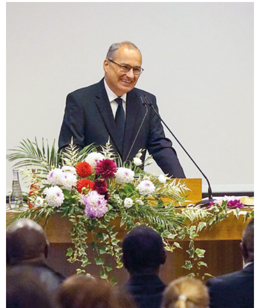
New Apostolic Church France

He had made enemies of everyone, this Paul: the Jews because he had turned away from them, the Greeks because they considered themselves intellectually superior, and the Romans because he placed Christ above the emperor.