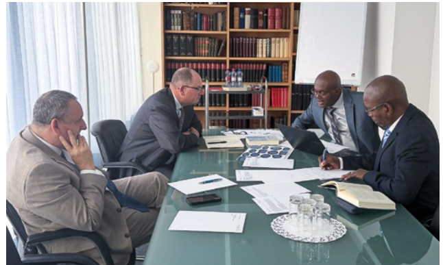
New Apostolic Church International