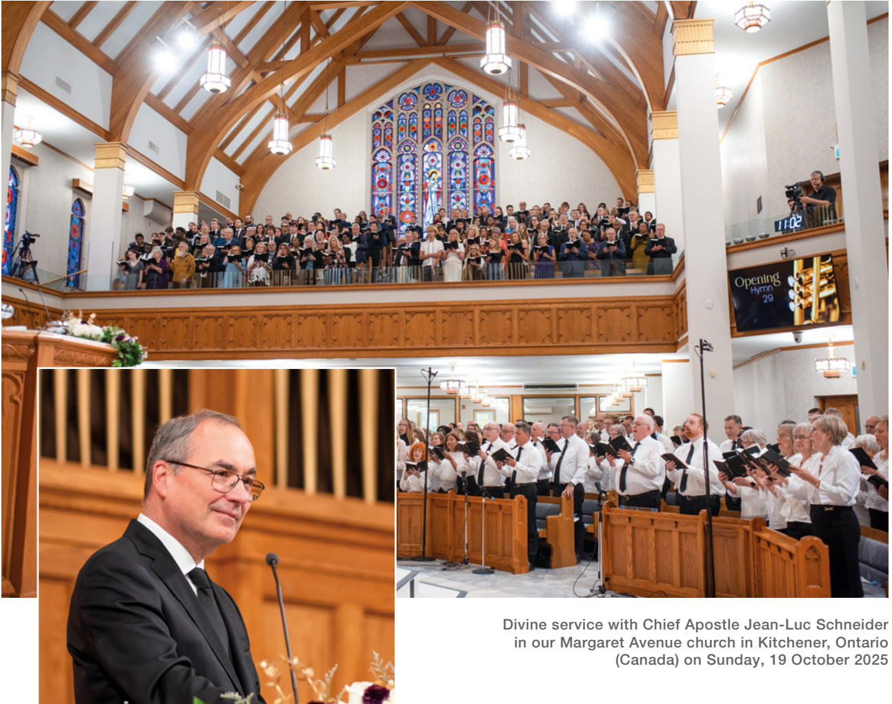
New Apostolic Church Canada