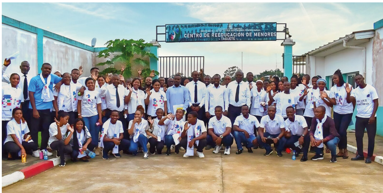
Visiting the juvenile detention centre in Tegucigalpa