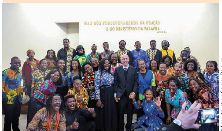
New Apostolic Church Portugal

After the concert it was clear: “The New Apostolic Church in Portugal has agreed to support the growth of this music project in the future,” it says on the official website of the Regional Church.