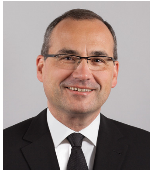
New Apostolic Church International

That was the Father of Jesus Christ. And He is our Father as well. We believe that God loves us, not because He gives us a lot of money or solves all of our problems, but because His love allows us to remain faithful until the end and