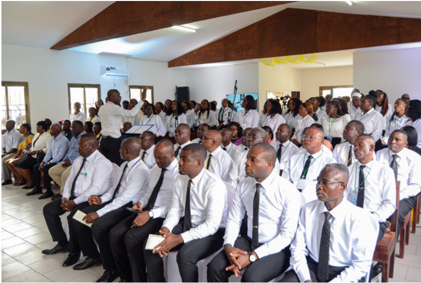
The congregation in Libreville on 5 October 2025

“Let us treat His gifts with respect.” Just as God is faithful, “let us too be faithful and do good, even when things are going badly for us”.