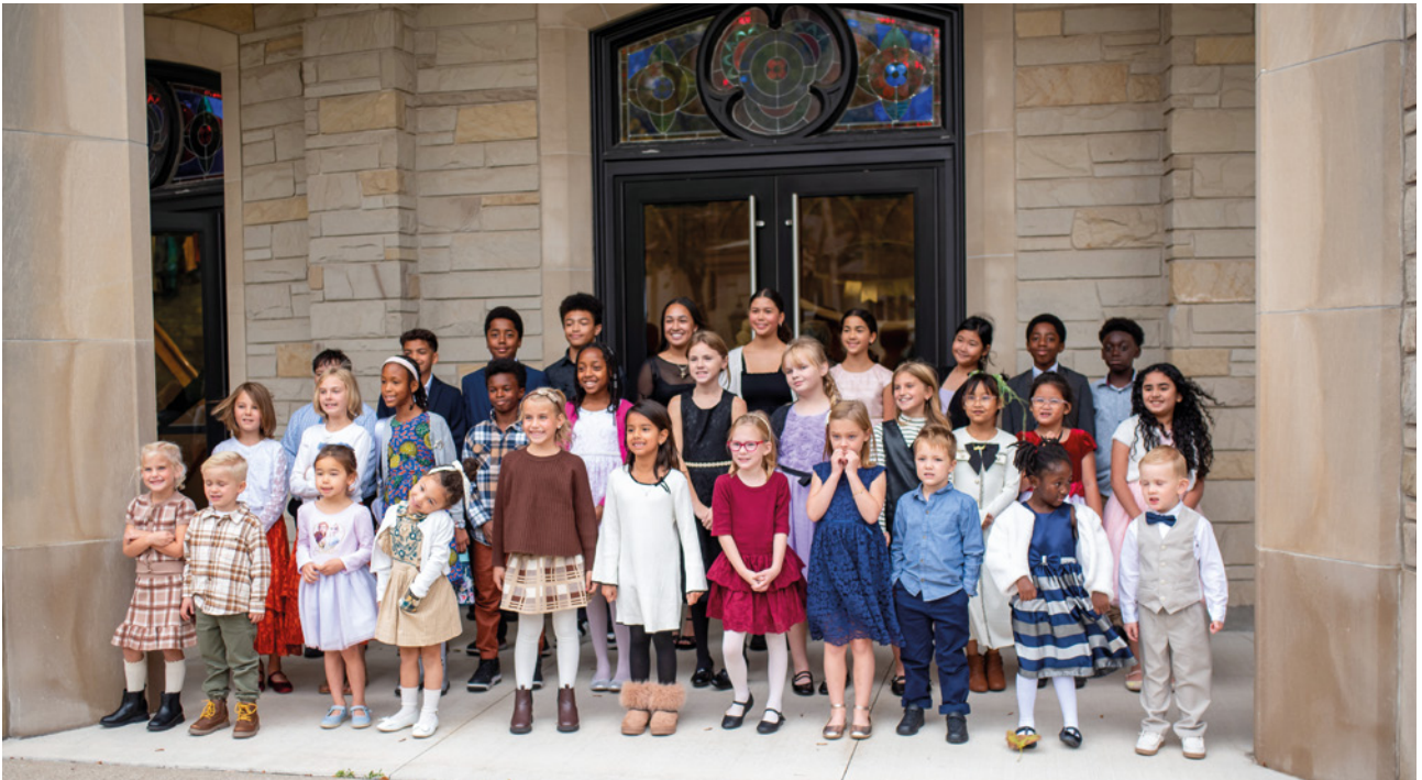
Children welcome the Chief Apostle with a serenade

Jesus called for a new way of thinking: people would have to change their mindset, their attitude. Everything would have to become new