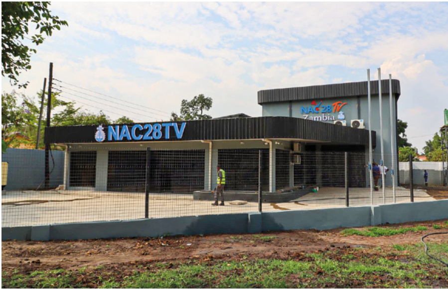
New Apostolic Church Zambia