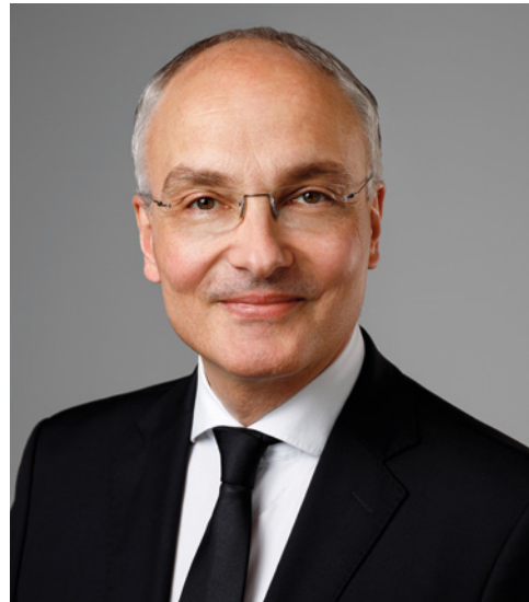
New Apostolic Church International

For all who look to Christ in this way, our annual motto becomes a promise: “Don’t be afraid. Just believe!” In a time, when many people are unsettled, troubled, and anxious, this is the divine answer of the Comforter—for perfect love drives out fear. May the love of Christ touch our hearts so that fear may lose its hold over us.