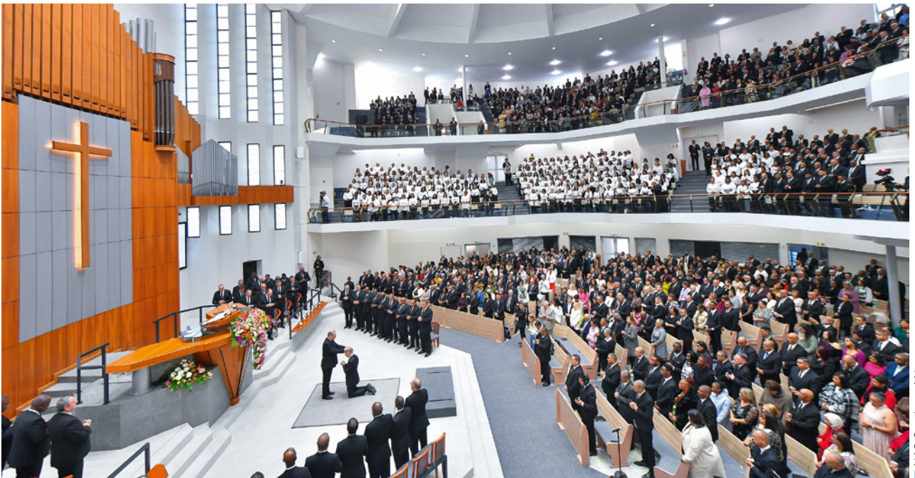
NAC Southern Africa