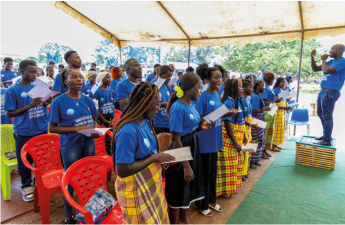
A choir provides the musical setting for the dedication service