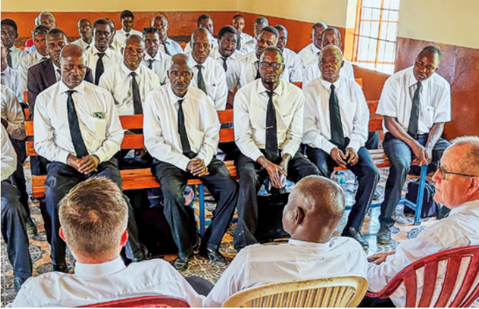
Ministers in discussion with District Apostle Pöschel (left)

are having a noticeable impact on church life, the New Apostolic Church Western Germany explains. In several countries in the region, unstable socio-political conditions make daily life difficult for the members and congregations. Travelling to divine services is sometimes fraught with risks, and external circumstances can limit regular pastoral care.