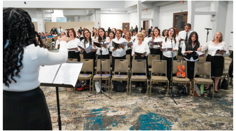
The orchestra and choir set the atmosphere