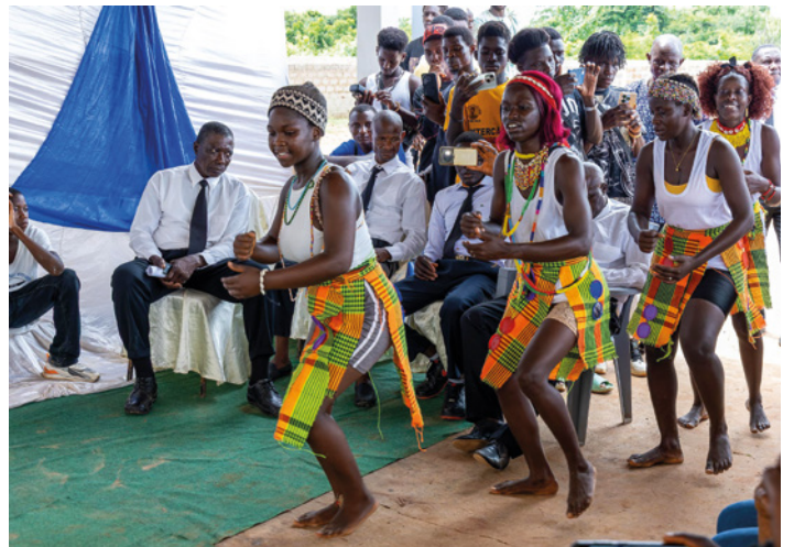
Traditional dances and a communal snack bring the dedication ceremony to a close

Outside, a large sports field offers space for football, volleyball, and basketball. Although the 4,000 square metre site is fenced in for security reasons, District Apostle Stefan Pöschel (Western Germany) emphasises that “the youth centre is not intended to be an anonymous place”. Rather, we want it to be “a home for our young brothers and sisters, a place where they feel welcome and accepted”. Young people from neighbouring villages are also warmly invited to visit.