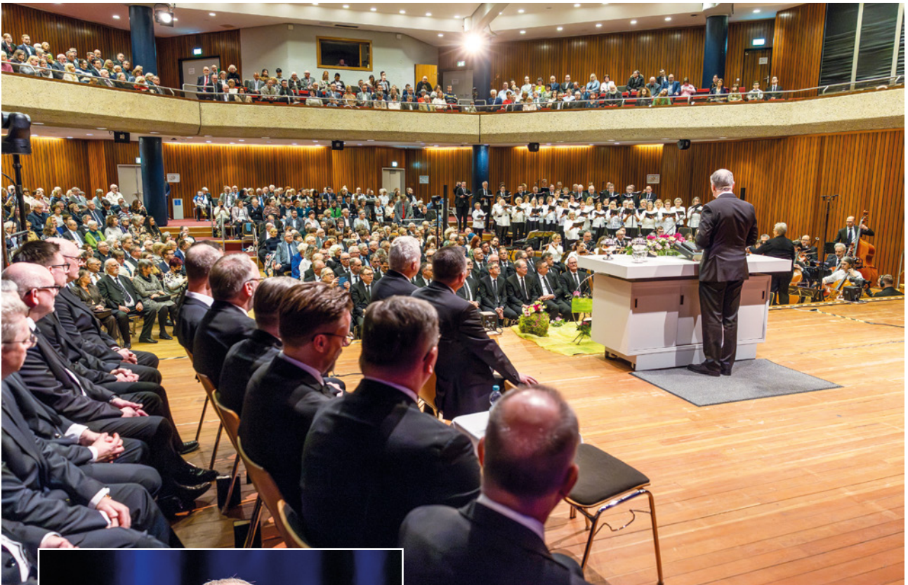
NAC Western Germany