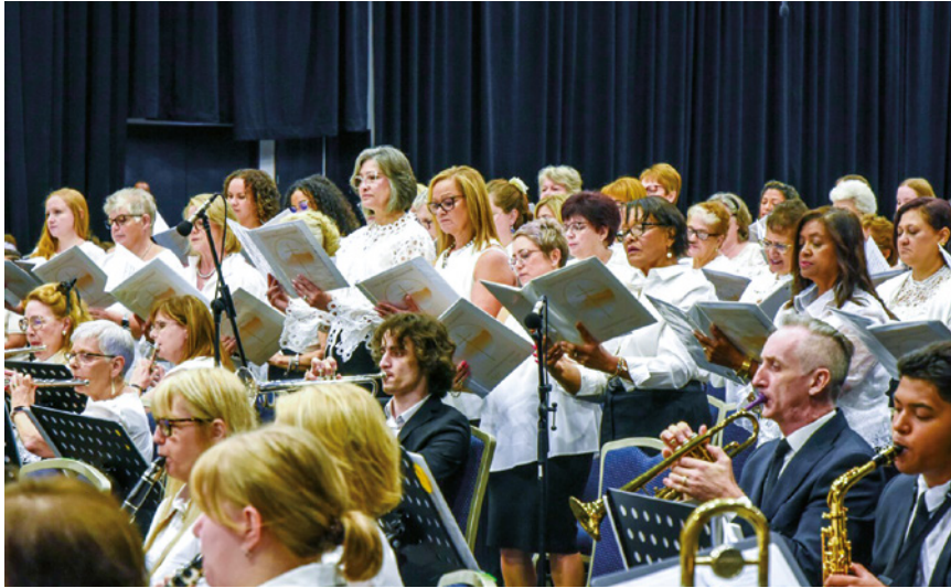
A choir and orchestra enrich the divine service